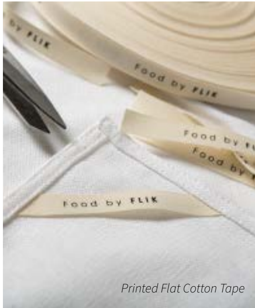
Printed Flat Cotton Tape