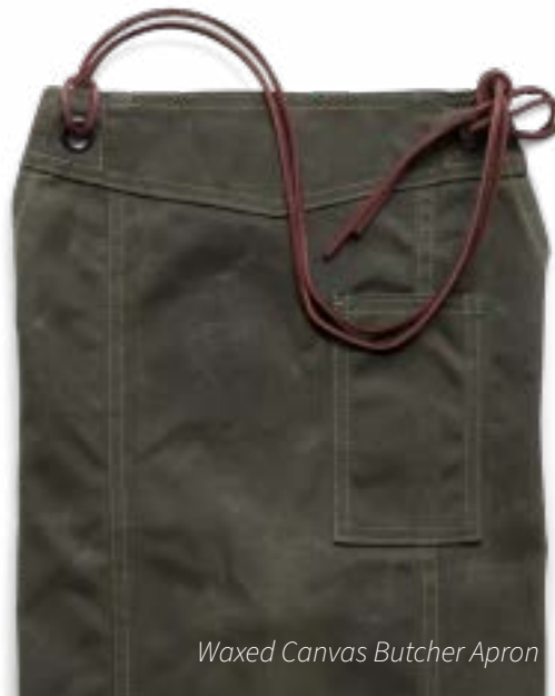
Waxed Canvas Butcher Apron