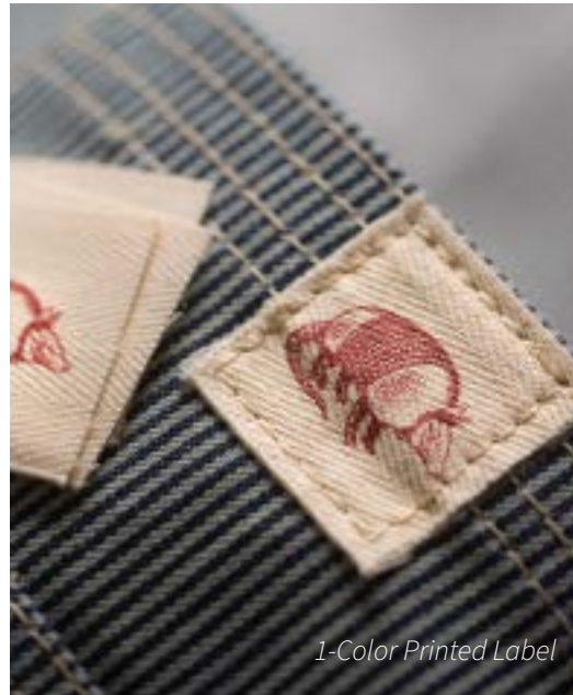
1-Color Printed Label