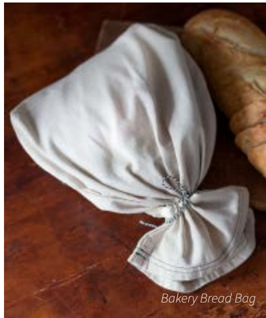
Bakery Bread Bag