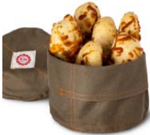
Fabric 'Bread Baskets'