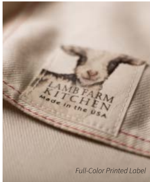
Full-Color Printed Label