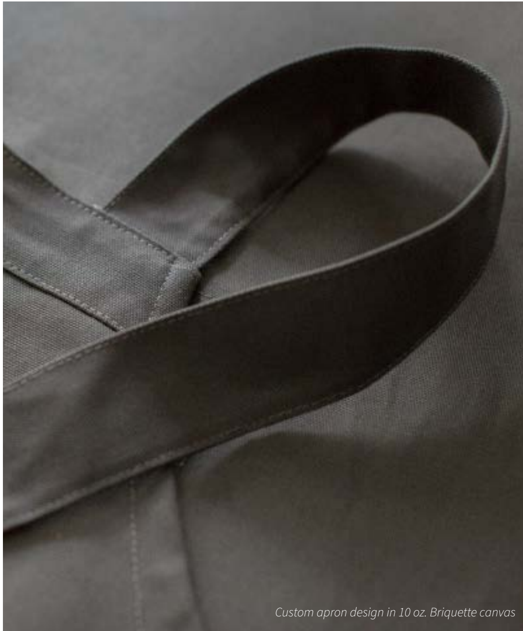
Custom apron design in 10 oz. Briquette canvas